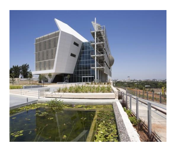
PORTER SCHOOL OF ENVIRONMENTAL STUDIES' NEW CAPSULE BUILDING

TAU's support for sustainable projects on campus is further underscored by the Porter School of Environmental Studies' new Capsule Building. The Capsule Building has received LEED Platinum Certification – the highest accreditation of the LEED certification system, developed by the US Green Building Council.