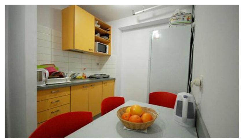
Inside an Einstein dorm room